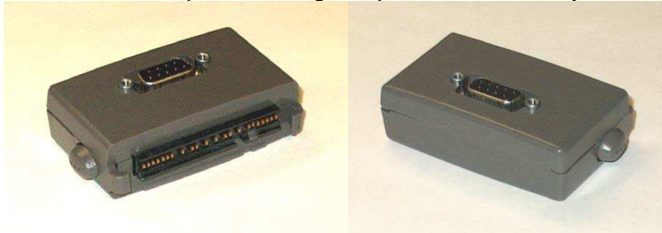
Alignment Notch Location